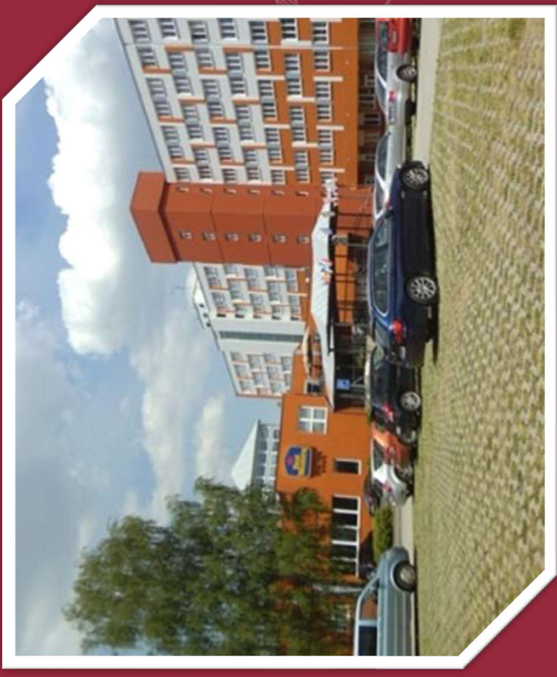
HOTEL BEST WESTERN, OSTRAVA